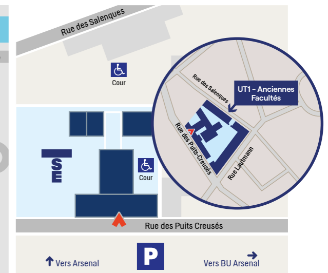
Anciennes Facultés Campus 2ter, rue des Puits-Creusés 31000 Toulouse, Tél. : 05 61 63 37