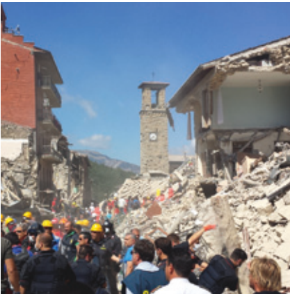
August 24, 2016: Corso Umberto in the historic centre in Amatrice, Italy, reduced to a pile of rubble.