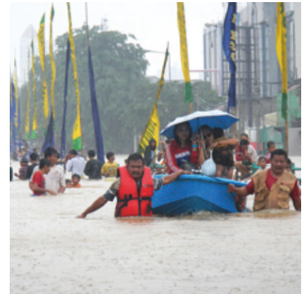
January 18, 2014: Residents cross flooded streets of Jakarta, Indonesia.