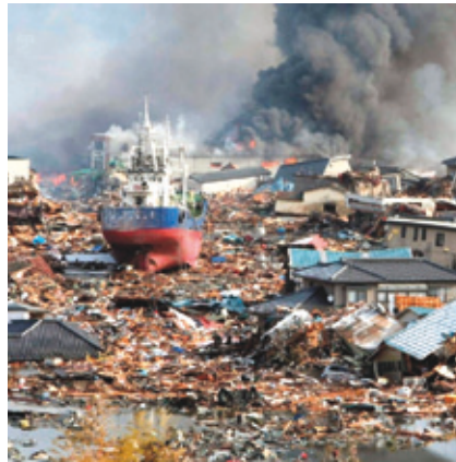
March 11, 2011: A magnitude-9 earthquake hit northeastern Japan which spawned a tsunami that left about 18,500 dead or missing.